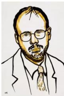
Michael Kremer Prize share: 1/3