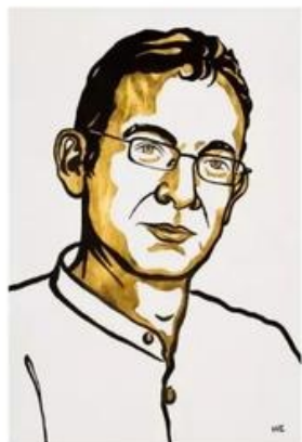
III. Niklas Elmehed. © Nobel Media. Abhijit Banerjee Prize share: 1/3