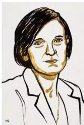
III. Niklas Elmehed. Esther Duflo Prize share: 1/3